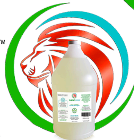
NANOLAVA™ laundry detergent

100% All-Natural Non-Toxic Biodegradable Hypoallergenic Non-Flammable Non-Hazardous