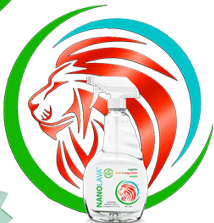
NANOLAVA™ fruit & vegetable wash